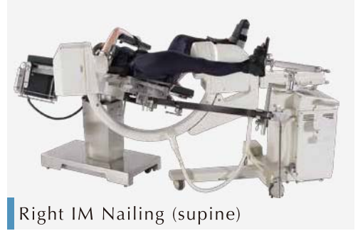
Right IM Nailing (supine)