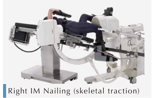
Right IM Nailing (skeletal traction)