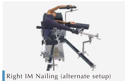
Right IM Nailing (alternate setup)