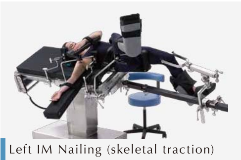
Left IM Nailing (skeletal traction)