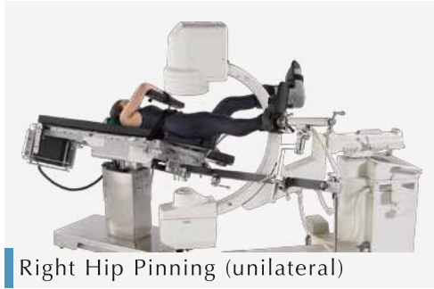
Right Hip Pinning (unilateral)