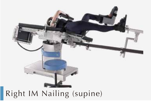
Right IM Nailing (supine)