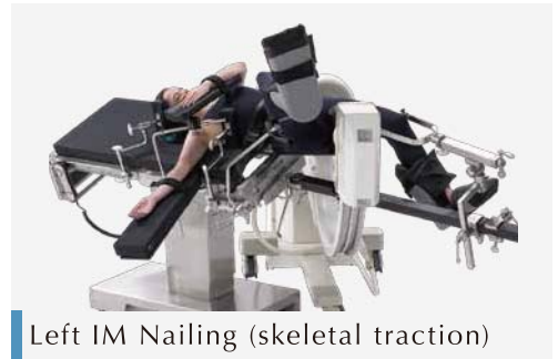
Left IM Nailing (skeletal traction)