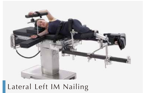
Lateral Left IM Nailing