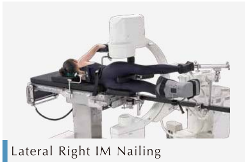
Lateral Right IM Nailing