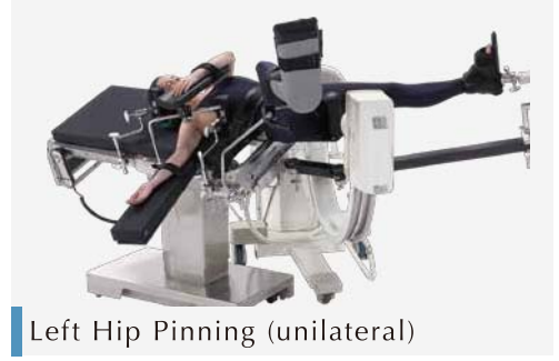
Left Hip Pinning (unilateral)