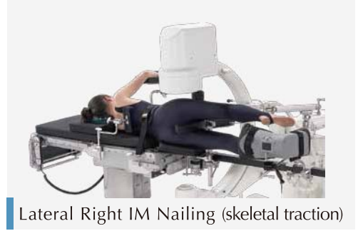
Lateral Right IM Nailing (skeletal traction)