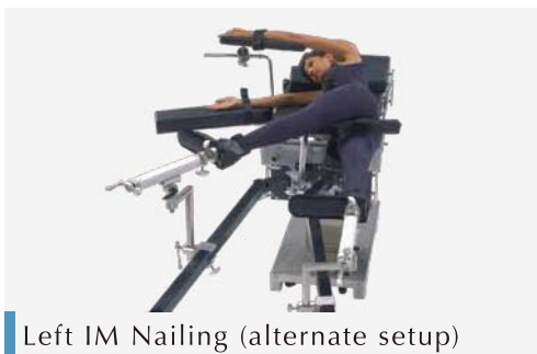
Left IM Nailing (alternate setup)