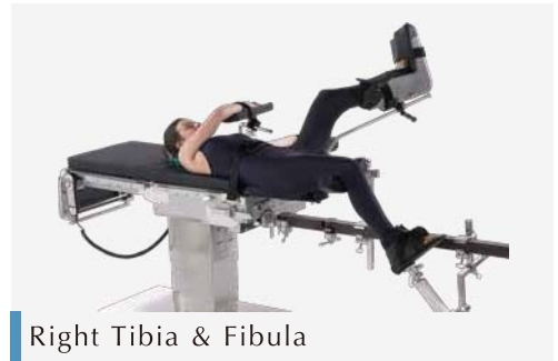
Right Tibia & Fibula