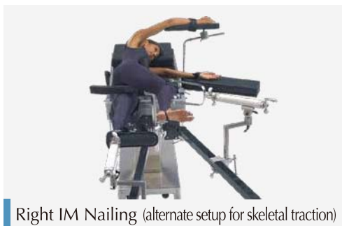
Right IM Nailing (alternate setup for skeletal traction)