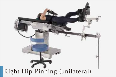
Right Hip Pinning (unilateral)