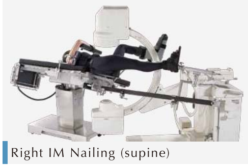
Right IM Nailing (supine)