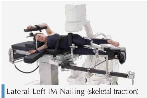
Lateral Left IM Nailing (skeletal traction)