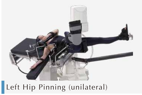
Left Hip Pinning (unilateral)