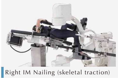
Right IM Nailing (skeletal traction)