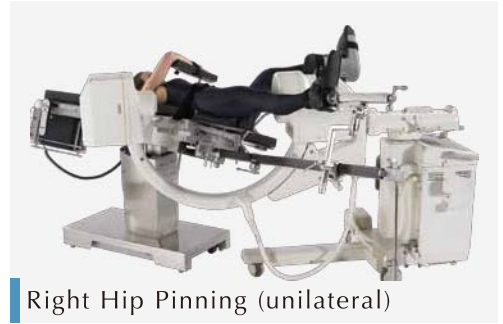
Right Hip Pinning (unilateral)