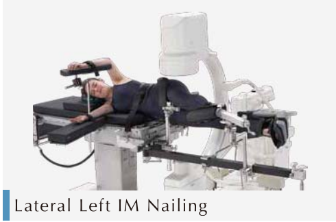
Lateral Left IM Nailing