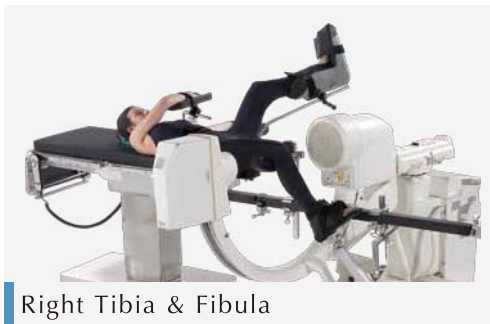
Right Tibia & Fibula