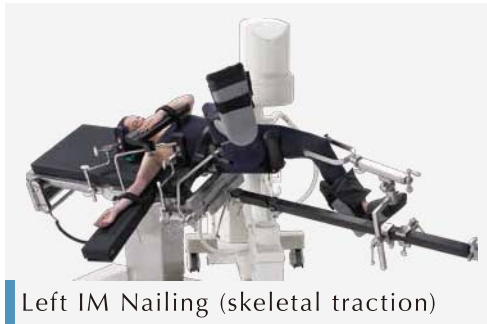
Left IM Nailing (skeletal traction)