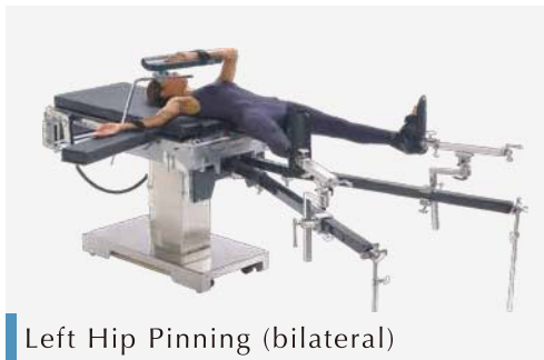
Left Hip Pinning (bilateral)