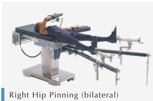
Right Hip Pinning (bilateral)