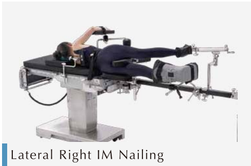
Lateral Right IM Nailing