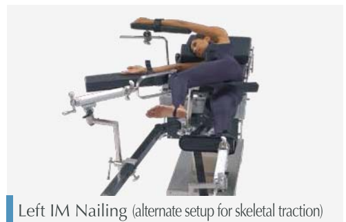
Left IM Nailing (alternate setup for skeletal traction)