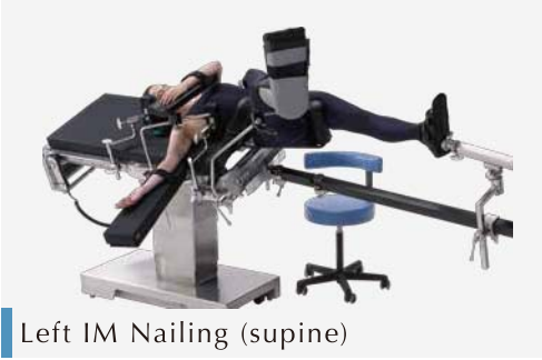
Left IM Nailing (supine)