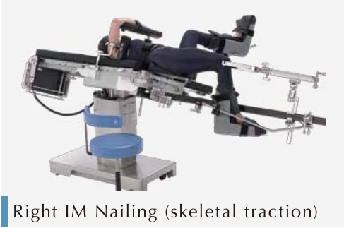
Right IM Nailing (skeletal traction)