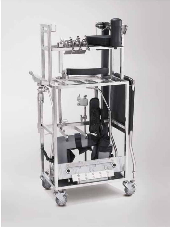
ACC0061 FOR USE WITH T1000 SERIES