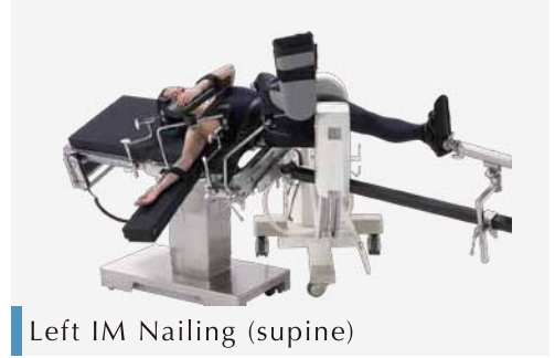
Left IM Nailing (supine)