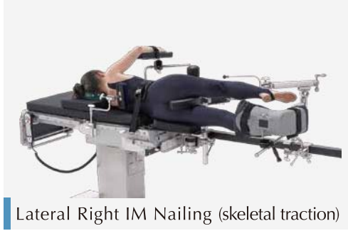
Lateral Right IM Nailing (skeletal traction)