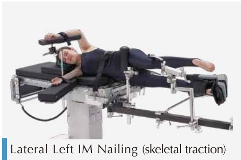
Lateral Left IM Nailing (skeletal traction)