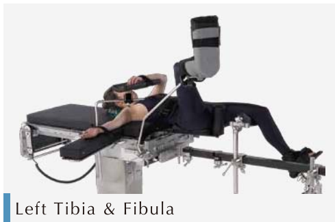
Left Tibia & Fibula