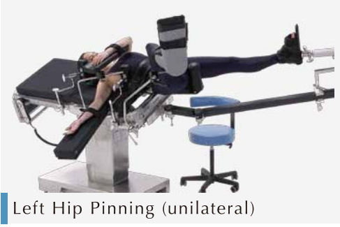
Left Hip Pinning (unilateral)