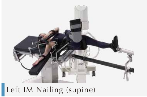
Left IM Nailing (supine)